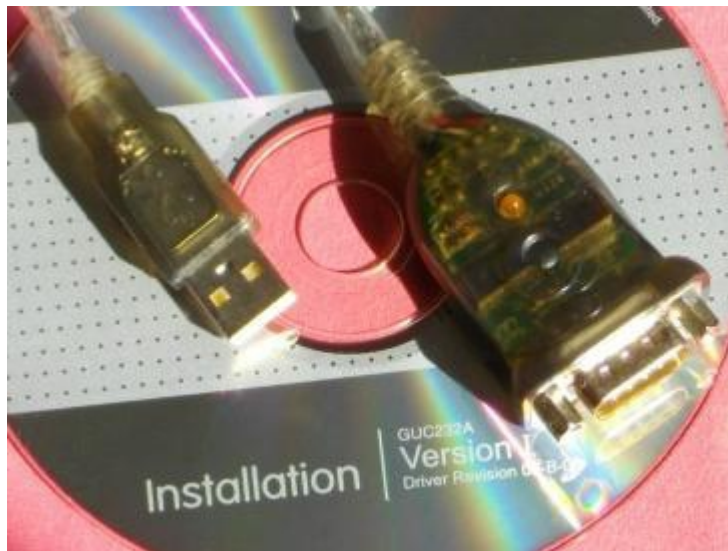
Fig 1 USB / SERIAL Converter