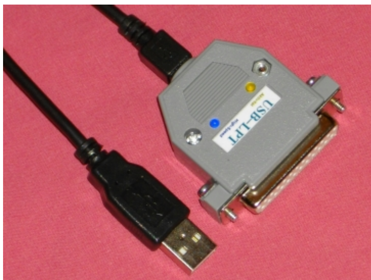
Fig 2 USB / PARALLEL Converter USB2LPT 1.7

It works with all versions of Windows, from Windows 98 to Windows 7. Two types are available : USB2LPT 1.6 and USB2LPT 1.7. For information, USB2LPT 1.6 has some limitations. It does not allow the use of a printer (remark: InstantTrack has an option to print tables for predicting satellite pass ) and it may be incompatible with certain USB host controllers. I was able to install USB2LPT 1.6 successfully on a computer running Windows XP. The installation tests on two other computers including a laptop were unsuccessful.